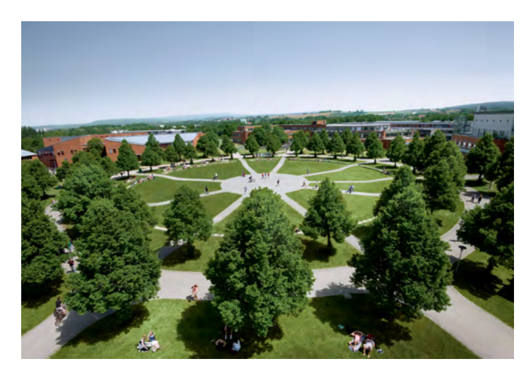
At the University of Bayreuth, you will find a range of opportunities for international exchange and focused research.