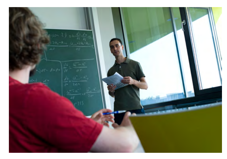
Interdisciplinary education at the forefront of research is our mission. The Elite Programme provides the chance to study topical problems at the interface of biology and physics in distinct courses in small groups.