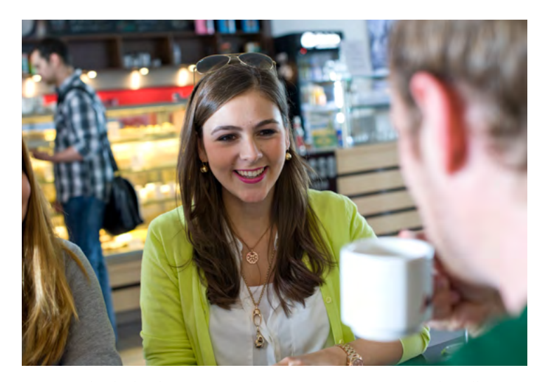
An individualized programme, short communication ways, and excellent relationships between supervisors and students create an atmosphere where studying is both an intellectual challenge and a personal joy.