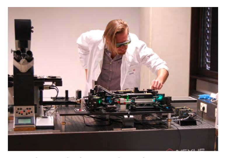
Enjoy learning and working in a stimulating and open environment. We offer a diverse array of courses, ranging from lectures and lab courses to research projects abroad.